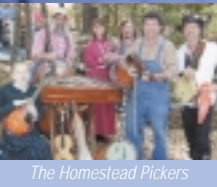
The Homestead Pickers

Holy Child N.S., Naas, Scoil Bhride Milltown, Churchtown N.S. Athy, Convent of Mercy Naas, Allenwood Boys N.S., St. Laurences N.S., Ballytore, St. Brigids N.S., Celbridge, Scoil Phadraig, Clane, Kildangan N.S., Monasterevin, Scoil Bhride Naofa, Kildare Town, St. Joseph's B.N.S. Kilcock and Scoil San Carlo Senior, Leixlip will participate in workshop/ performances by The Homestead Pickers, Percussion Instruments Around the World and Meet the Composers.