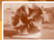
Front cover: "Siren" outside Naas Fire Station, by Alex Pentek.

Recent Per Cent for Art projects are unveiled and details of training programmes for artists are outlined. Details of all our programmes are also available on www.kildare.ie/arts