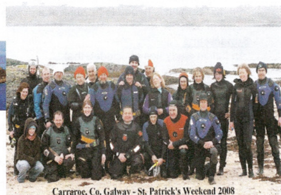
Carraroe, Co. Galway - St. Patrick's Weekend 2008

Schull We arrived Friday evening fully loaded and adjourned to The Black Sheep Pub. Sat. wind was F7 with sea swell not diving weather. All was not lost we did some Cox'n training instead. Sun. morning much better we had some nice leisure dives. Back to the house for the three S's! out to The New Haven Restaurant to recharge then onto B Sheep to finish. Mon. we had a nice drift dive The divers who had SMB's were easy enough to find. All in all a good weekend and cheap accommodation thanks to Liam W