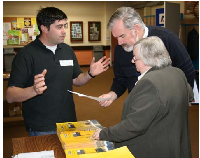
Getting informed by the exhibiting renewable energy and energy efficiency suppliers