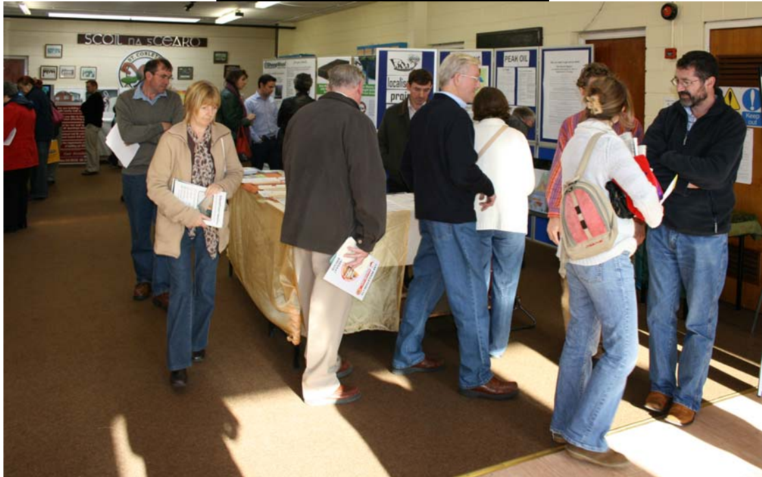
Visitors at the Energy Fair in front of the FADA Stand