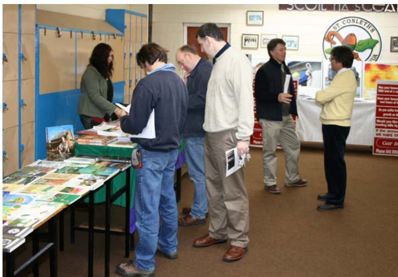
The exhibitors included Walnut Books