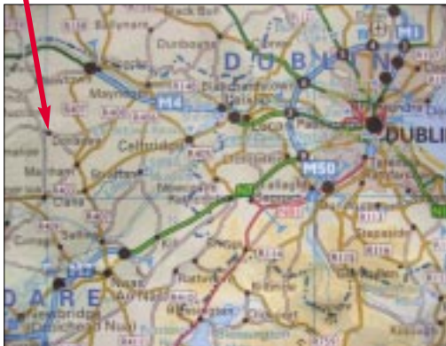
Map 1: Dublin to Donadea Forest Park, Co. Kildare.