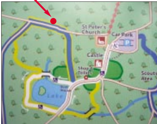
Map 2: Donadea Forest Park, Co. Kildare.